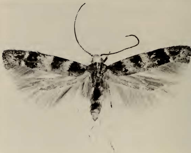
FIG. 1. Exoteleia anomala , new species, holotype male.

R. Stevens; Hopkins U.S. #36961. Paratypes: 11 males, 8 females; same data as for holotype; USNM genitalia slides #10893–10902. 2 males, 4 females; Arizona, 10 km N Fort Apache; Pinus ponderosa , J. M. Schmid; Hopkins U.S. #66729, reared 8/82; USNM genitalia slides 11745–11748. In collection U.S. National Museum of Natural History.